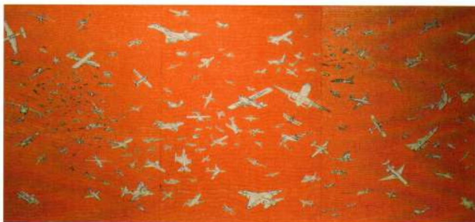
Alighiero Boetti, Aerei, 1983, Mazzoleni

use of celotex as an industrial material, Burri created a large oeuvre of works where variations in composition, colour, volume, form and texture were meticulously and systematically researched. By discarding the traditional approach to painting and utilising raw artistic expression, Burri altered the way in which artists subsequently worked around the world. Throughout his career, Burri participated