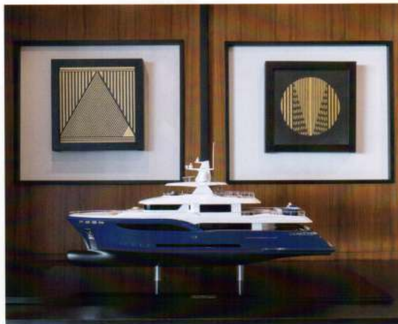
The works by Elio Marchegiani (1929) exhibited on board Stella di Mare during the Monaco Yacht Show.

What animates the mirror paintings by the renowned artist Michelangelo Pistoletto, is the duality of a fixed photo image placed on the surface of a reflective steel plate and the moving images produced by reflections of the viewer and their environment. The performative element of the works is completed by the observer who becomes the central protagonist.